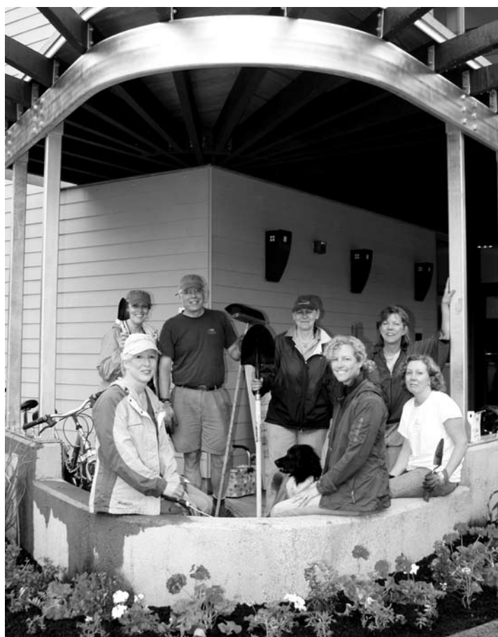
Volunteers smile after planting flower beds at Canal Street.

The gardens serve to bring beauty to the residents of COTS facilities. They are also a way to express to guests that they matter, to say we care that they have a place to stay that is safe, decent and full of hope.